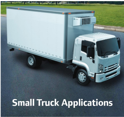
Small Truck Applications