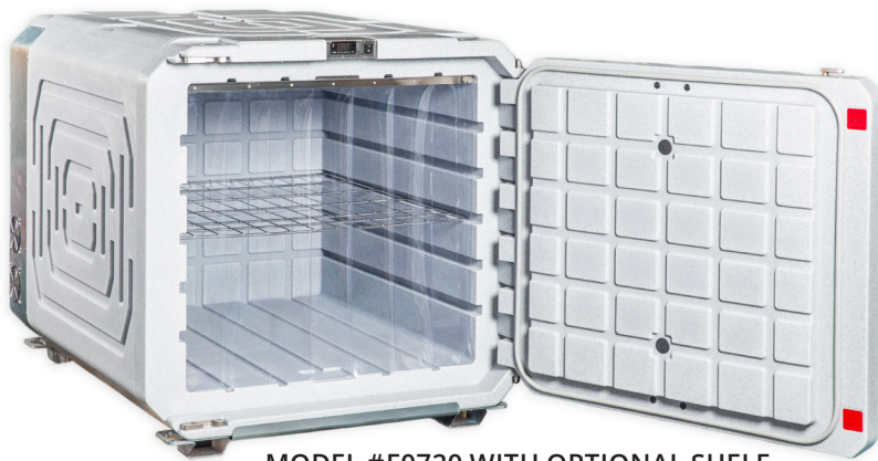
MODEL #F0720 WITH OPTIONAL SHELF